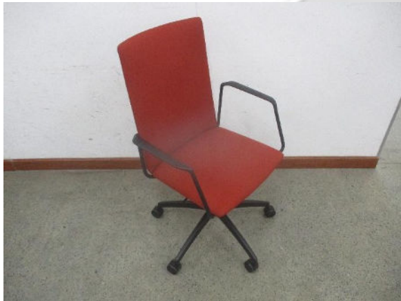
Overall View - Before Test