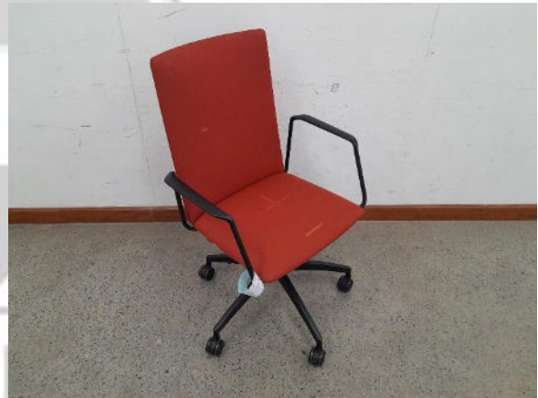
Overall View - After Test